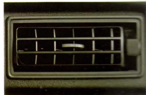
Illustrations show equipment which is available at extra cost: Radio, fresh air blower,

seats at foot level. Easy to hand is the stalk controlled two-speed windscreen wipers with electrically operated washers, the direction indicator stalk, hazard warning-lights switch, sun visors and safety interior mirror.