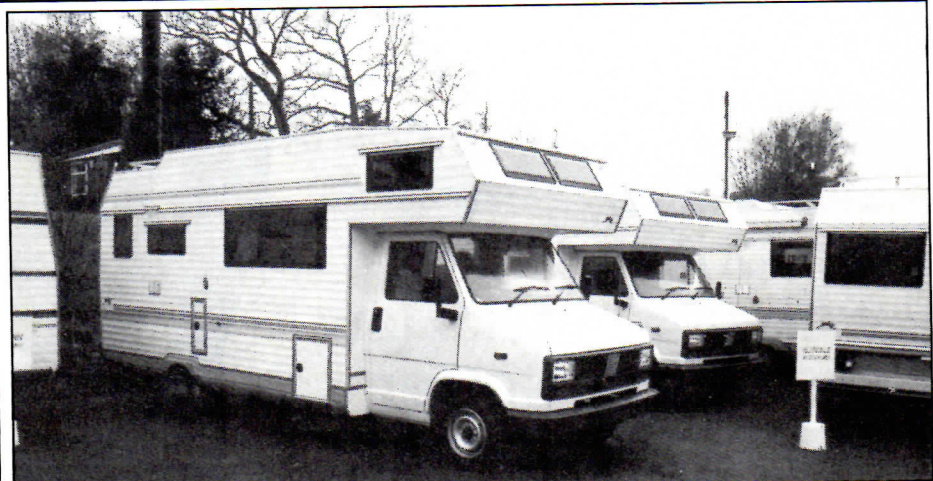
The most expensive — Glendale's luxurious 3000 GLX.

On show outside were models from Autohomes, Auto-Sleepers, CRV, Danbury, Devon, Glendale, GT Motorised, Holdsworth, Jurgens, Motorhomes International, Reimo, Tandy and Travelworld, plus other secondhand examples too numerous to be listed here. Amongst such a large collection of 'vans, it was difficult to know where to start. I decided to think about the extremes. Firstly, the most expensive! This was a Glendale 3000 GLX, on Fiat Ducato, priced at £19 500. As might be expected for the price, the interior was beautifully luxurious. The swivelling captain's chairs in the cab gave real comfort and support, and I liked the layout in which the living area was almost divided into two separate parts by the central work surface. In spite of this there was no feeling that the spaciousness of the accommodation had been sacrificed. I was particularly intrigued by the slide-out storage unit. I'd love one of those in my kitchen at home!