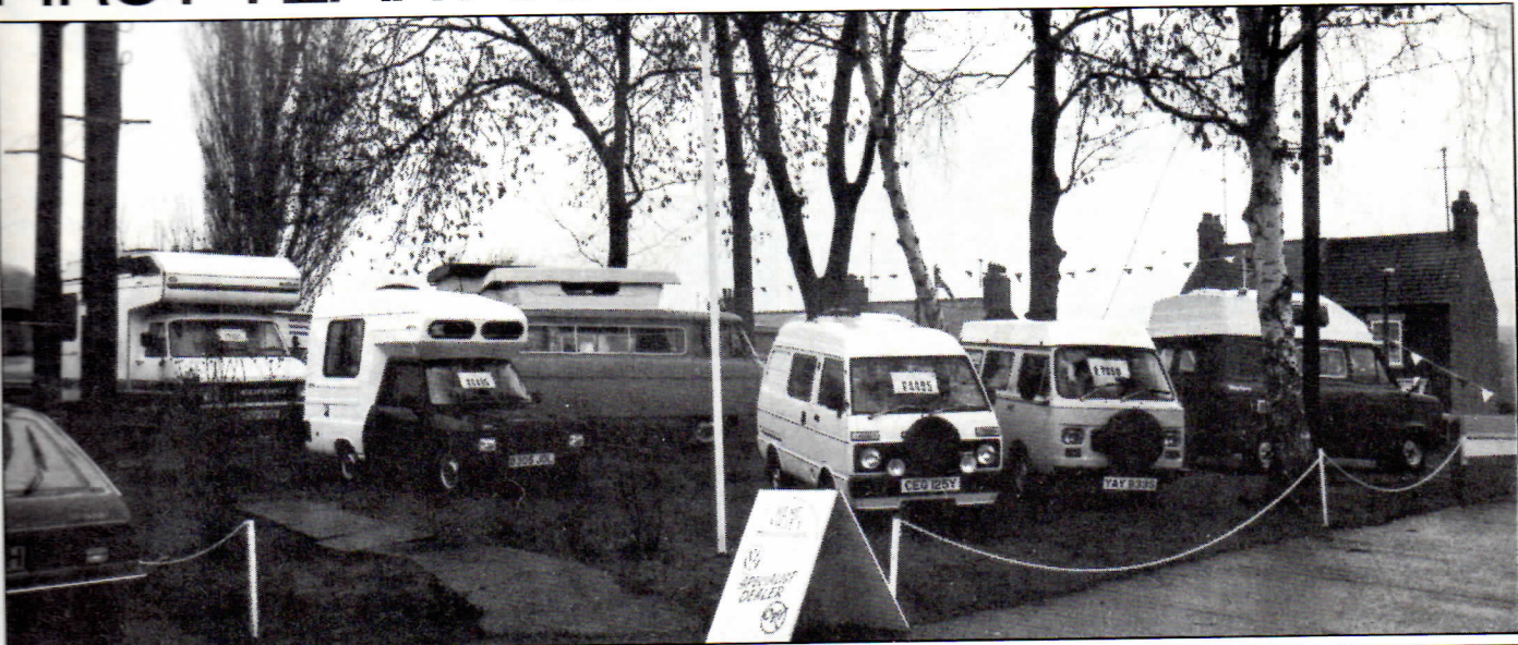
Three contenders for the smallest, amongst part of Nene Valley's secondhand display.