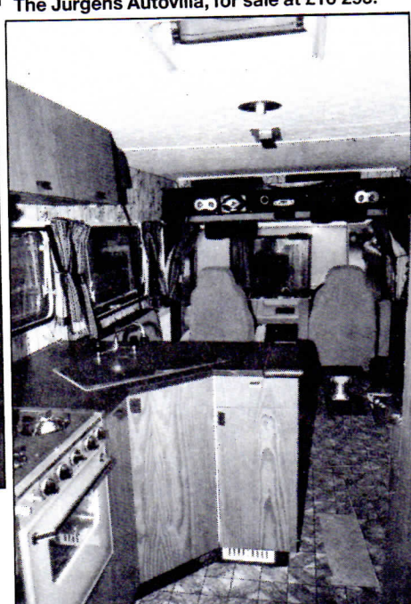
Inside the Mercedes. It needed some smartening up, but no-one could accuse it of being cramped!

having double rear wheels, it was priced at £16 295. I found that the dark colours and the net curtains combined to give the interior a slightly gloomy feel. I was also disappointed by some of the more minor details which I felt would quickly become annoying when living in the 'van. The crockery cupboard's upward hinging door was not self supporting when open and had to be anchored in place by two horrid little plastic catches which were most awkward to operate and didn't look at all long lasting. Similarly, the flaps covering the cooker and sink had to be propped open by means of a