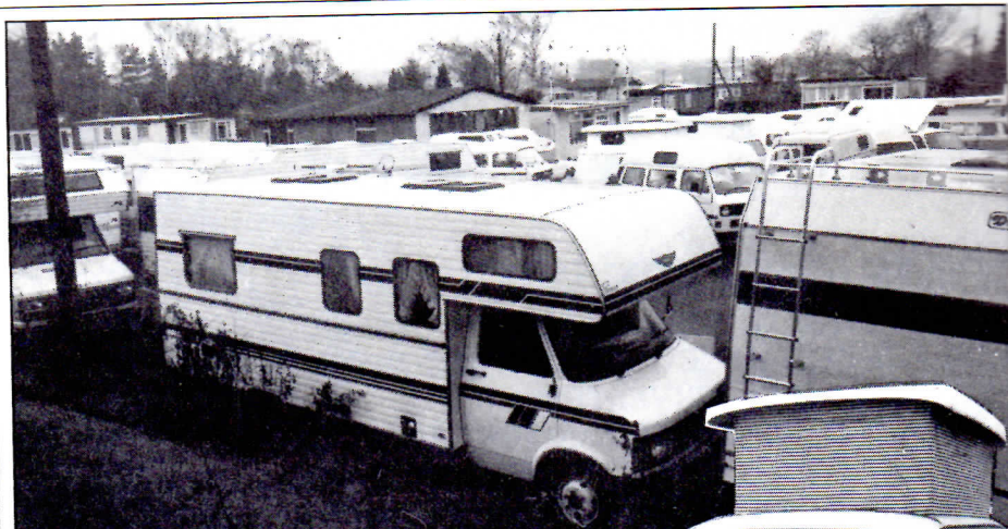
The Jurgens Autovilla, for sale at £16 295.

In attempting to find some motorcaravans which were rather more 'middle of the range', yet still perhaps less frequently written about, I went on to explore the Jurgens Autovilla. On a Bedford CF 350 and