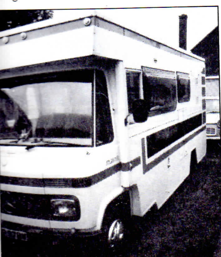
The largest — a Mercedes with special build Davik body.

having double rear wheels, it was priced at £16 295. I found that the dark colours and the net curtains combined to give the interior a slightly gloomy feel. I was also disappointed by some of the more minor details which I felt would quickly become annoying when living in the 'van. The crockery cupboard's upward hinging door was not self supporting when open and had to be anchored in place by two horrid little plastic catches which were most awkward to operate and didn't look at all long lasting. Similarly, the flaps covering the cooker and sink had to be propped open by means of a