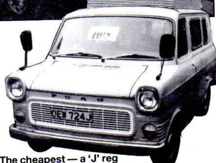
The cheapest — a 'J' reg Canterbury on Ford Transit.

crude system of chains. It's hardly what one expects when paying that sort of money for a motorcaravan. On the plus side there was a huge ventilator in the roof and I liked the capacious shower room, the fact that the washbasin had its own water supply and the exterior television aerial controlled from the interior.