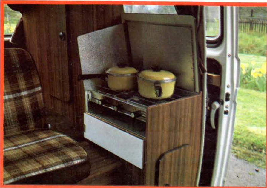
The neat, easy to clean, stainless steel cooker with grill.