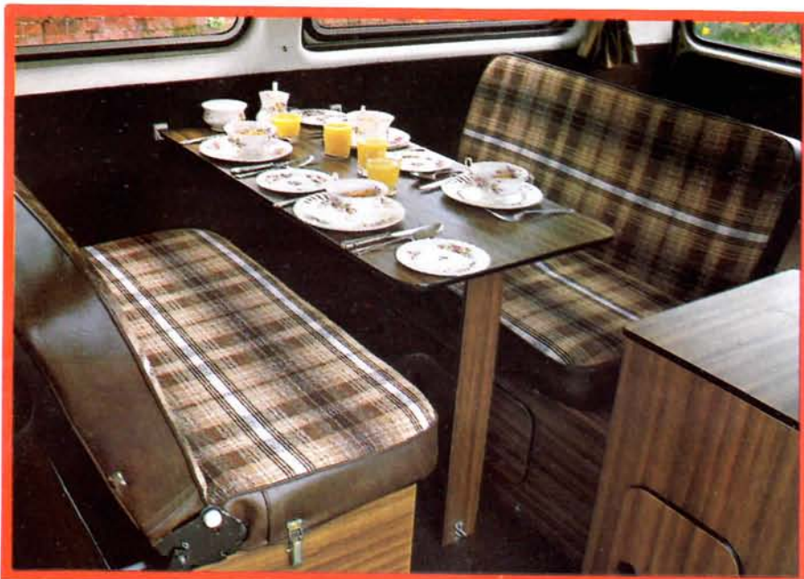
Seats simply reverse to give a pleasant secluded dining room.